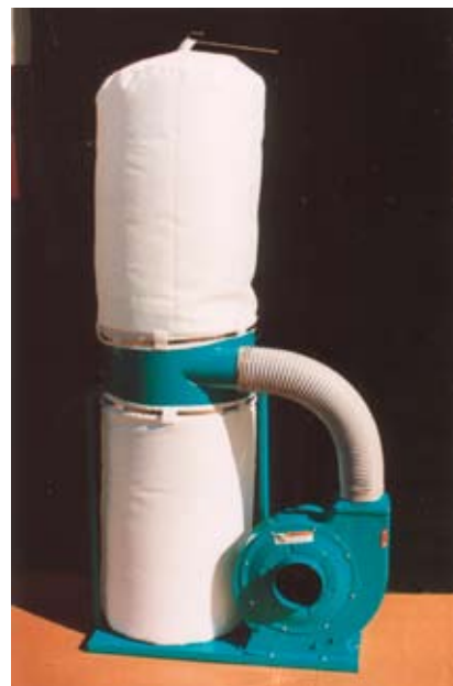
Model No. 15-10481