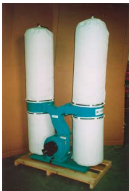
Model No. 15-15481 Model No. 15-16483